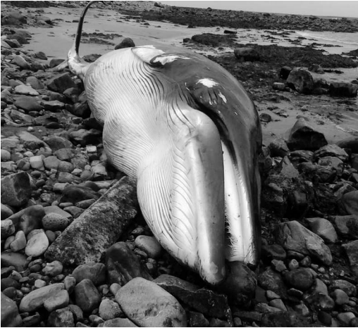
FIGURE 1. Adult female common minke whale ( Balaenoptera acutorostrata ) found stranded in Aberdeenshire, Scotland, UK, September 2014 with large swelling on throat.

and anaerobic blood agar with naladixic acid and vancomycin (Oxoid) at 37 C and examined at 48 h. Culture of the lung produced a mix of bacterial flora overgrown with Proteus sp. The liver produced a mixed growth of Edwardsiella tarda and Granulicatella balaenopterae ; the latter was also isolated from the kidney. Anaerobic cultures on the abscess contents and RPLN were negative after 48 h of incubation. Colonies typical of Brucella spp. were visible on CSBA and Farrell's medium after 3 d. Subcultures of the suspect Brucella sp. were incubated aerobically at 37 C on CSBA. Bacterial colonies were subjected to Gram and modified Ziehl-Neelsen (MZN) stains and agglutination with Brucella abortus -positive control serum (Remel/Thermo Dartford, UK; Davison et al. 2015). The isolate (M251/14/1) agglutinated B. abortus -positive control serum, was a gram-negative, MZN-positive coccobacillus, and was not CO 2 dependent. The isolate was lysed by phages BK2 (Berkeley), Wb (Weybridge), and Fi (Firenze) (Corbel et al. 1979; Table 1).