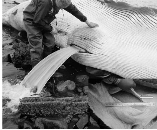
FIGURE 2. Throat swelling of stranded common minke whale ( Balaenoptera acutorostrata ) in Aberdeenshire, Scotland, UK, September 2014, after incision showing large volume of yellow fluid. Inset: close-up of abscess and necrotic material (arrow). Ruler=30 cm.

Molecular characterization of the outer membrane protein 2 ( omp2 ) using a selection of restriction enzymes revealed the type to be N(K), found previously in short-beaked common dolphins ( Delphinus delphis ) and striped dolphins ( Stenella coeruleoalba ; Dawson et al.